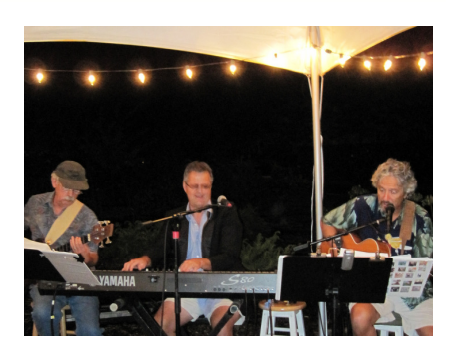
Enjoy the sounds of Island Trio