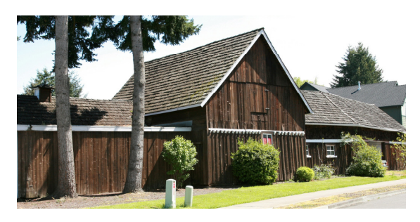
Left: Jurgens Barn